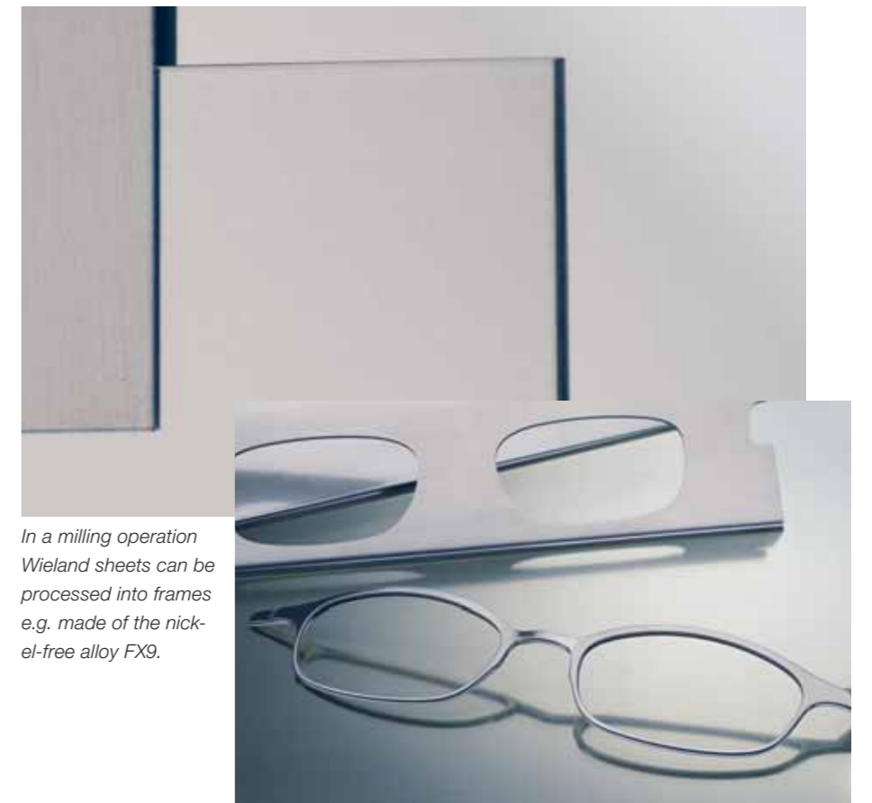
In a milling operation Wieland sheets can be processed into frames e.g. made of the nickel-free alloy FX9.