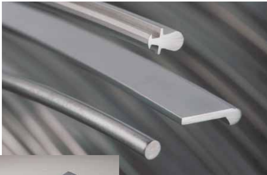
Round or sectional nickel-silver wire is often the pre-material for spring hinges.